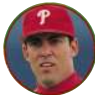
Rubén Amaro Jr.